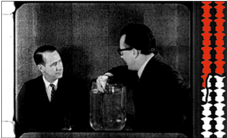
Image: Digital still. 16 MM film on video