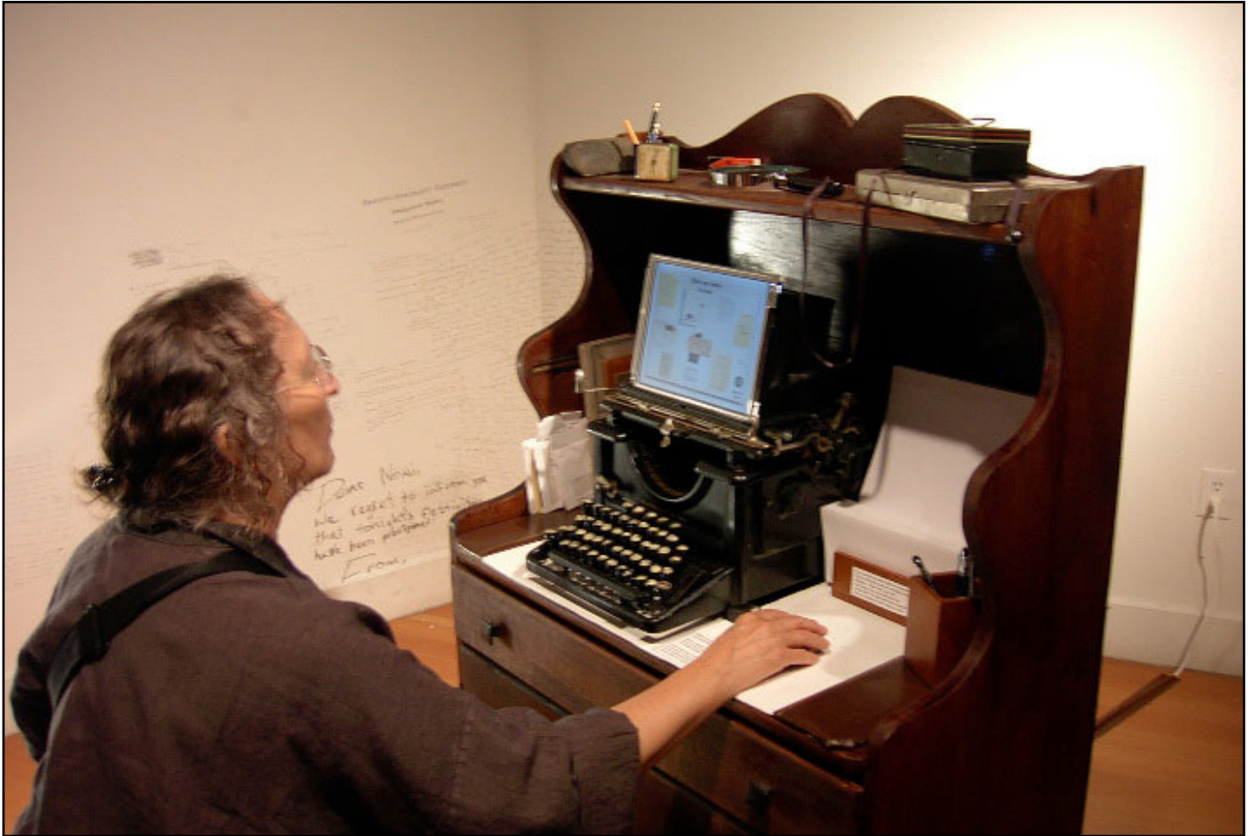
Image: Audience interacting with the Typewriter/computer/screen