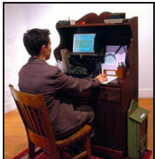
Images: Right: One of the letters in the program (front view) and navigation buttons Left: Audience interacting with the Typewriter/computer/screen